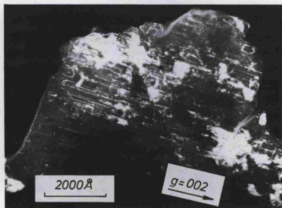
Fig. 2. Dislocations in shocked olivine from Apollo 11 (10085,26). Transmission electron micrograph. Dark field image produced by a reflection \vec{g} = 002 . Particle normal near [010]. Acceleration voltage 100 kV. (Siemens Elmiscope 101.)